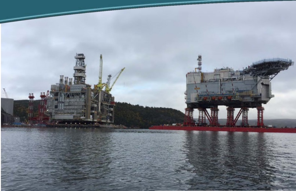
The living quarters loaded on barge (right, on jacking tower) being transported prior to installation on utilities process module (left).

The living quarters will provide accommodations for 220 people offshore.