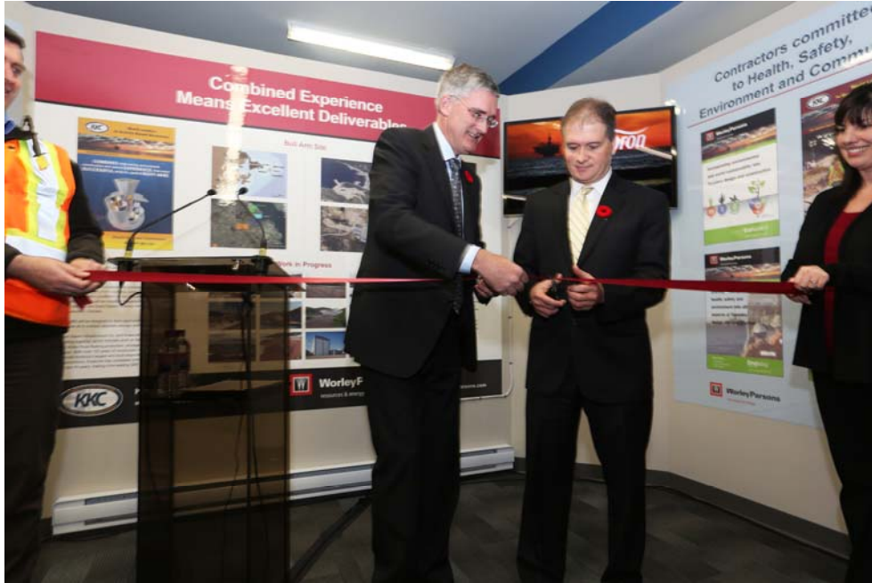
The official opening of the Bull Arm information centre (October 2012)