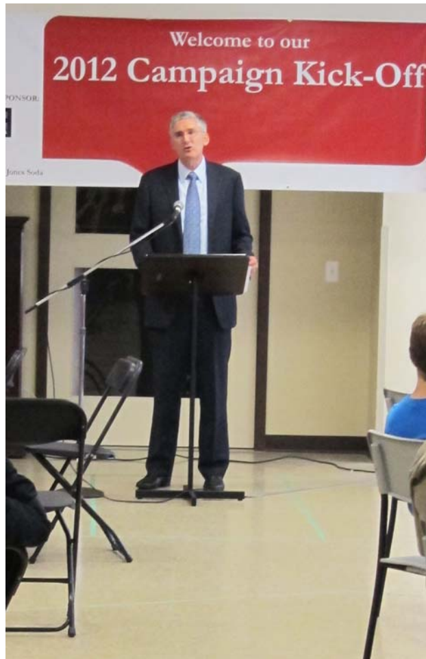
United Way Fundraiser Kick off (October 2012)