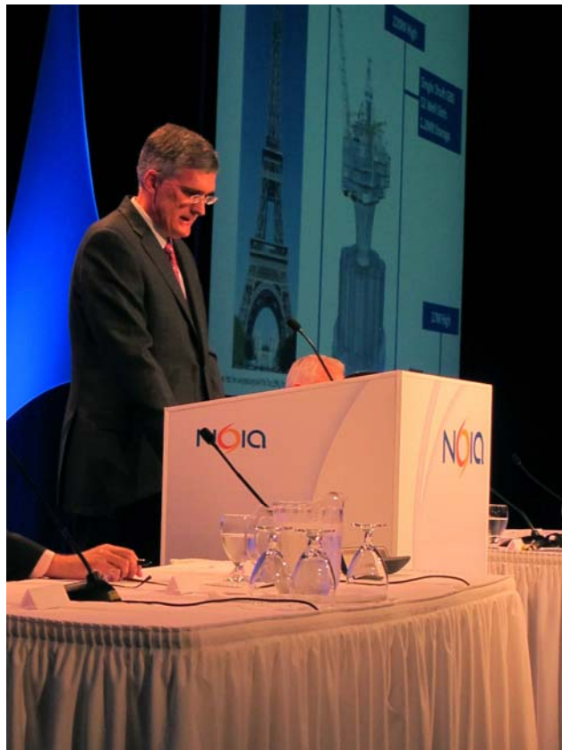
Hebron Senior Project Manager presenting at 2012 NOIA Conference (June 2012)