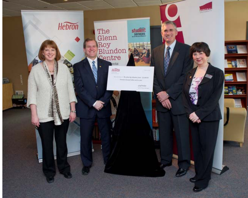
The Hebron Project and Memorial University's Glenn Roy Blundon Centre for Students with Disabilities announced the The Hebron Project Psychological - Educational Assessment Bursary. This bursary will provide assistance to students who are otherwise unable to access services offered at the centre. (February 2012)