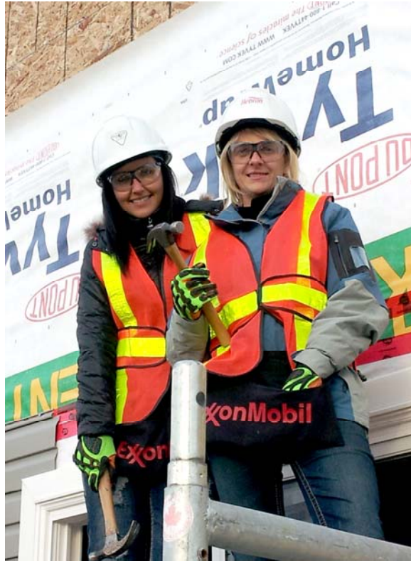
Members of the Hebron team volunteering for 'Habitat for Humanity' (October 2012)