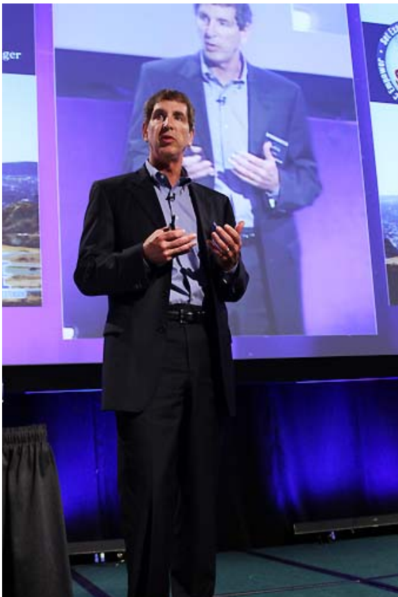
Hebron's GBS Project Manager presenting at ExxonMobil Eastern Canada Projects Contractor Safety, Security, Health and Environment Forum at the Sheraton Hotel in St. John's. (August 2012)