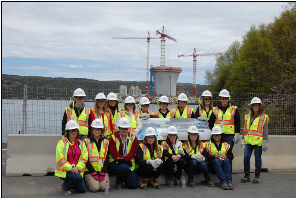
Hebron staff host female apprentices at Bull Arm