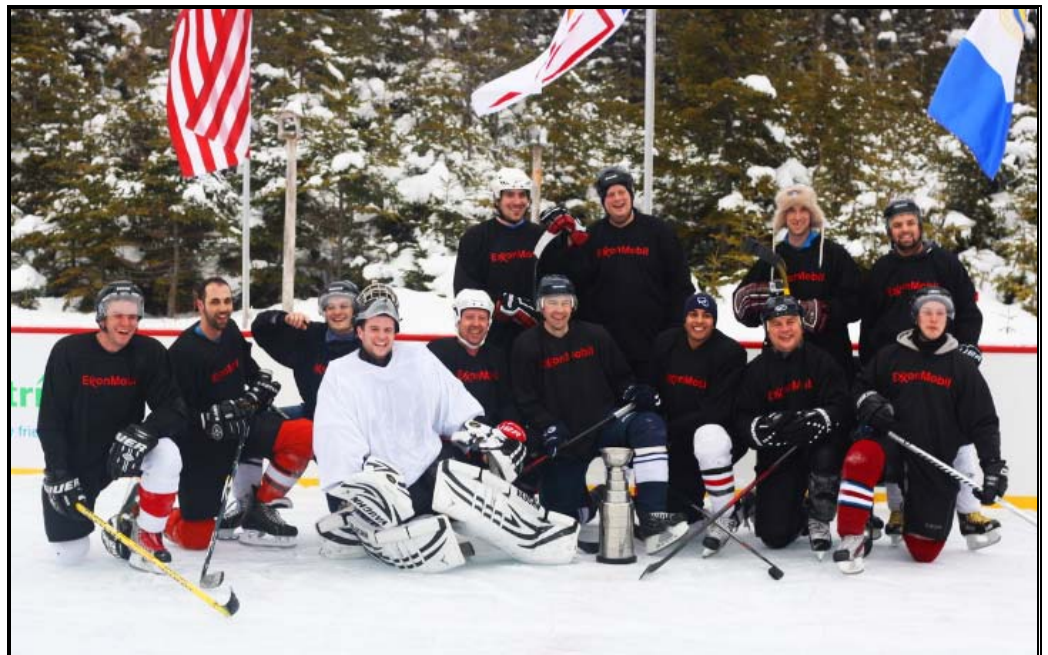
ExxonMobil hockey team at the Hebron Cup

The annual Hebron Cup hockey tournament was held on January 24, 2016. Donations from the Hebron Project and staff went to Reason for the Rink children's charities.