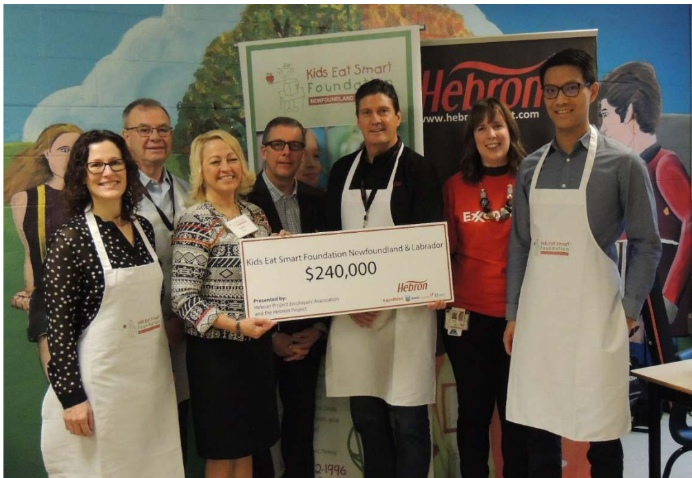
Representatives from ExxonMobil Canada, Hebron Co-venturers and the Hebron Project Employers' Association present a donation to Kids Eat Smart Foundation NL