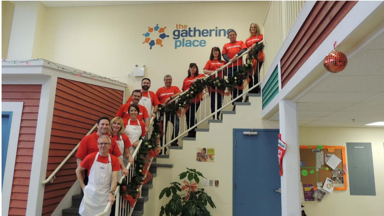
ExxonMobil Canada employees volunteering at the Gathering Place