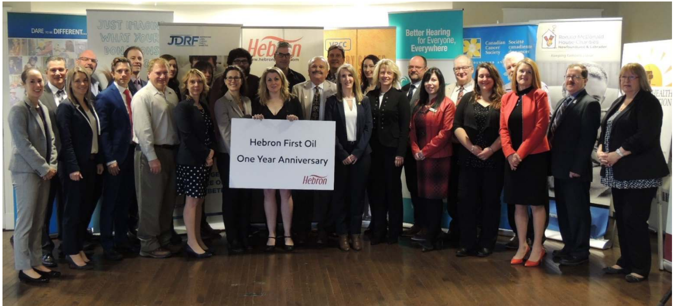
Hebron Project marked one year of production with a Day of Giving. On hand at the event were representatives from Hebron operator ExxonMobil Canada, co-venturers (Chevron Canada, Suncor Energy, Equinor Canada and Nalcor Energy – Oil and Gas), the Hebron Project Employers’ Association and 10 local charities: Janeway Foundation, Young Adults Cancer Canada, NL Hard of Hearing Association, Ronald McDonald House, Daffodil Place, Discovery Health Care Foundation, Juvenile Diabetes, Mazol Shriners, MS Newfoundland & Labrador, and Women in Resource Development.