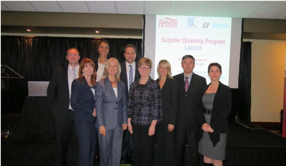
Hebron, Hibernia and Hibernia Southern Extension launch their respective Supplier Diversity Programs October 23, 2013