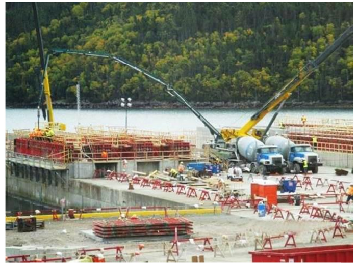
Concrete placement on the Topsides pier as part of upgrades.