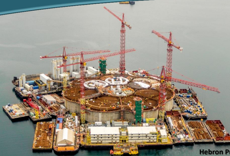
Hebron Project Issue 10 - Quarter 3 2015