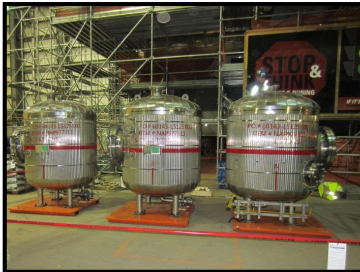
Hot water tanks for installation on the living quarters.