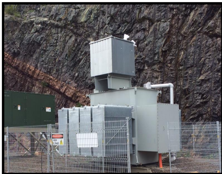
Integration pier substation installed for temporary power during Topsides hook-up and commissioning