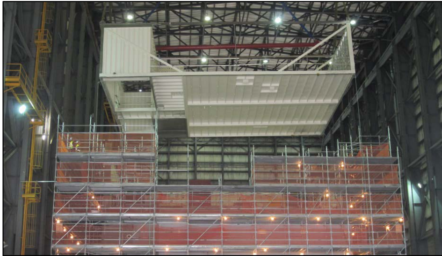
Continued assembly of Living Quarters Module which will contain cabins to house workers offshore