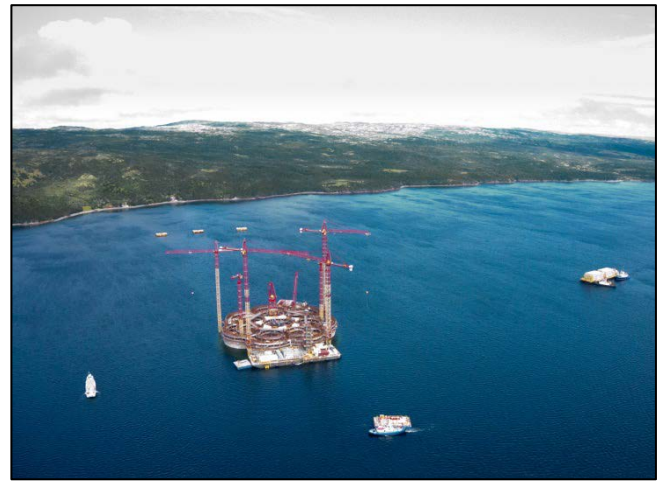
Gravity Based Structure (GBS) at Deep Water Site