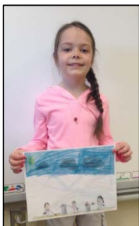
Paige Rose Kindergarten

Poster contest winners pose with the winning entries: