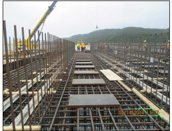
Integration Pier upgrades