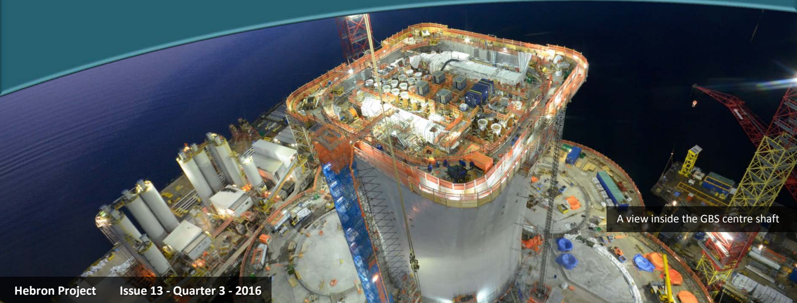
A view inside the GBS centre shaft

Hebron Project Issue 13 - Quarter 3 - 2016